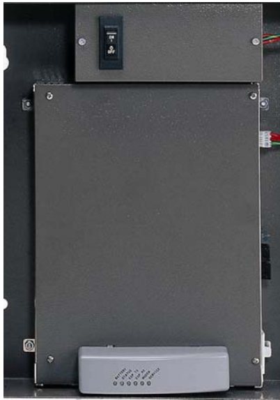
Figure 2. Raptor Network Manager